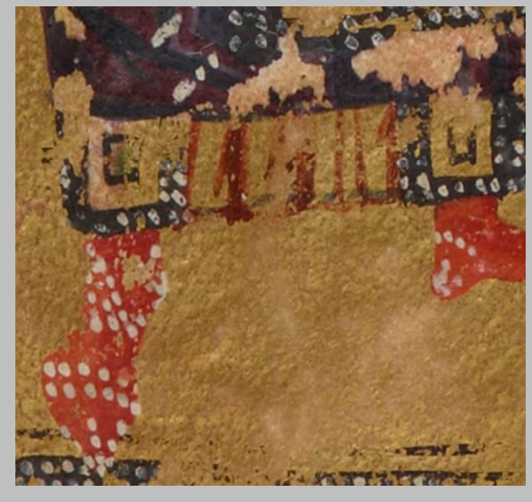
St Naum, Ohrid King Uros